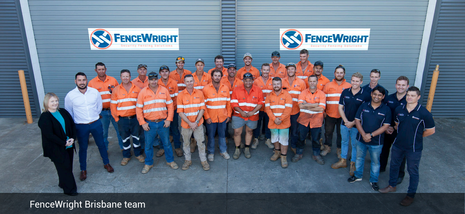
FenceWright Brisbane team