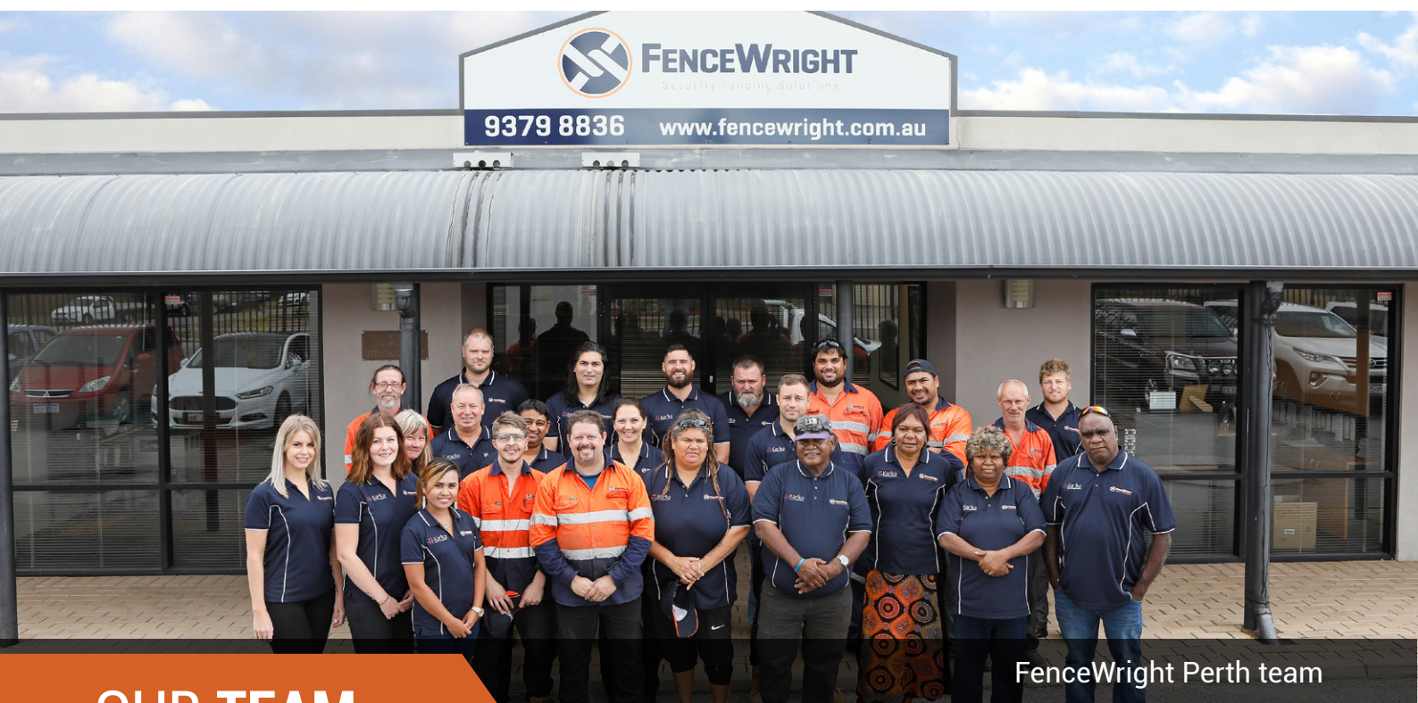
FenceWright Perth team